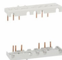
3P Rigid connecting kits for BF09...BF25 BFX3102