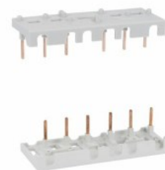
3P Rigid connecting kits for BF26...BF38 BFX3201