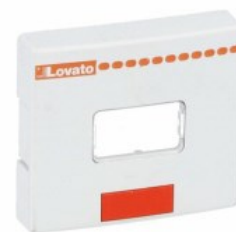
Sealing cover for BF00 and BF09...BF38 BFX80