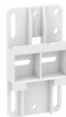
Universal base to screw fix for BF09...BF38 BFX8901