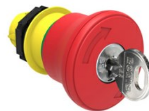
Mushroom head pushbutton, Latch, turn key to release Ø 40mm/1.6" LPCB684