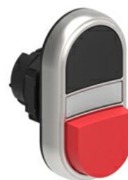
Double-touch actuators, spring return white indicator - One extended and one flush pushbuttons LPCBL72