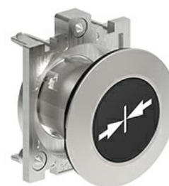
Pushbutton actuators, spring return, with symbol LPFB15