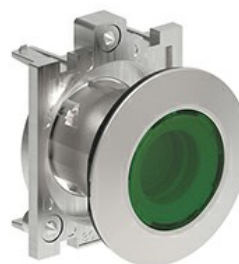
Illuminated button actuators, spring return - Flush LPFBL10