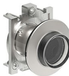
Illuminated button actuators, spring return - Extended LPFBL20