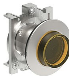
Illuminated push- push button actuators - Extended LPFQL20