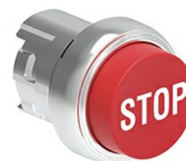
Pushbutton actuators, spring return, with symbol LPSB21