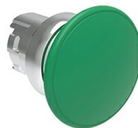
Mushroom head pushbutton, spring return Ø 40mm/1.6" LPSB614