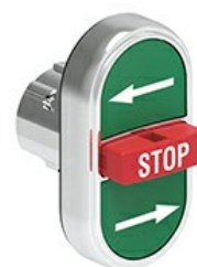
Triple-touch actuators, spring return - One middle extended buttons LPSB73