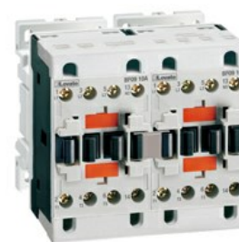
Reversing contactor BFA012