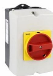
Empty plastic enclosures GAZ